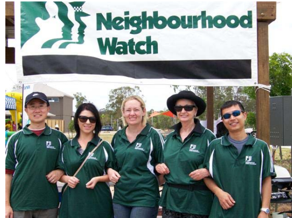
Members of Carseldine 10 NHW Committee

Congratulations to all on Saturday's launch.